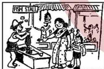
walk, fish stall, mother