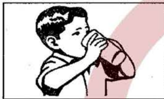
drink, milk, morning

The following pictures show what Saliya did last Sunday . Write a sentence about each picture. Use the words given below the picture. Each sentence must have at least five words . The first one is done for you.