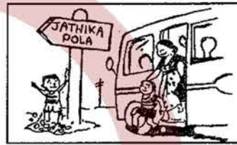
go, fair, mother