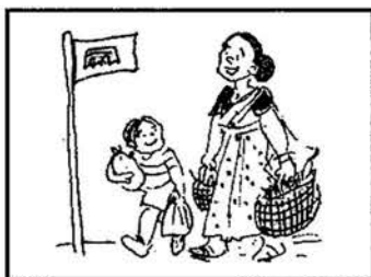
carry, bags, bus stop