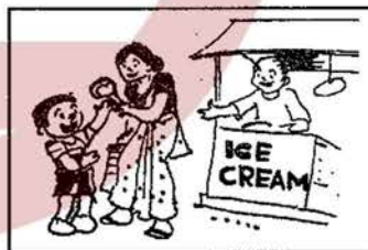
take, ice cream, mother